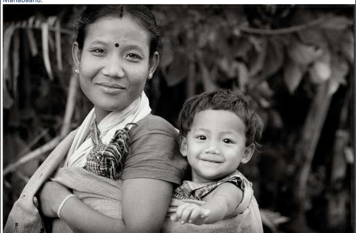
DAY 4: MISHING VILLAGE VISIT

We return for lunch. This evening we enjoy the Chef's Cooking Demonstration and sample the snacks followed by a leisurely evening on a deserted island with bonfire is always unusual. We enjoy dinner on MV Mahabaahu.