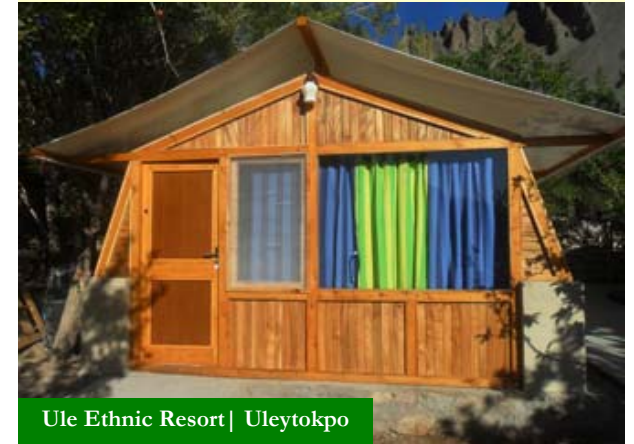
Ule Ethnic Resort | Uleytokpo