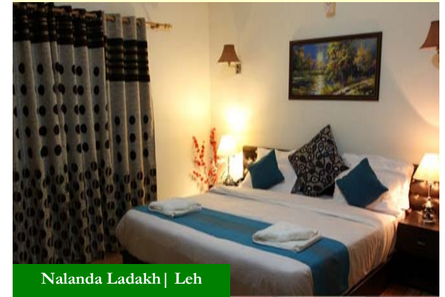
Nalanda Ladakh | Leh

Note: In case any of the suggested hotels are unavailable at the time of booking, similar or upgraded hotels shall be provided.