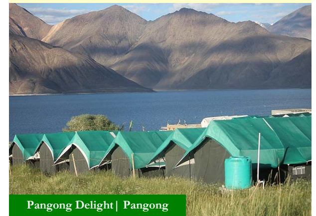
Pangong Delight | Pangong